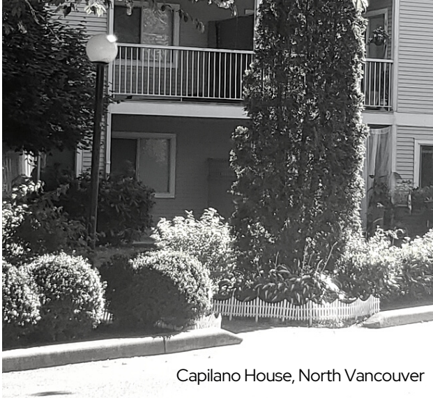
Capilano House, North Vancouver

Gardening is meditative and therapeutic for increased mental wellness. And we know our residents love to garden! This is why ENF is applying for grants to fund Community Garden pilot projects at 2 sites in North Vancouver and Surrey.